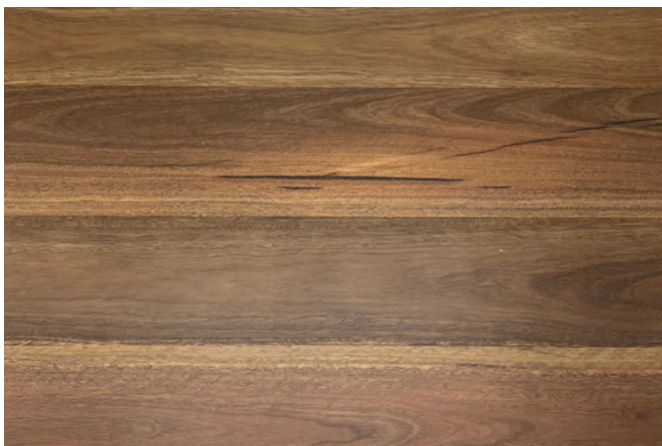
QLD Spotted Gum